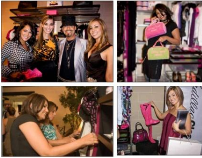
Party guests shopped the Dallas Cadillac Closet