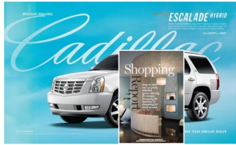
Cadillac-sponsored Shopping Guide, a booklet inserted atop a Cadillac spread in FASHION