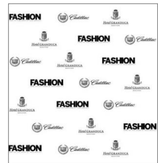
Step-and-repeat backdrops lined the red carpet and featured Cadillac's logo