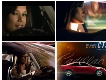
Cadillac ad looped on flat screens at the party