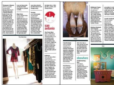
Shopping Guide pages 6 and 7