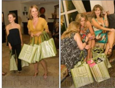
Goodie bags given to each guest included a Cadillac brochure and gifts