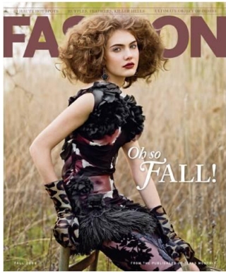
FASHION from the publishers of Texas Monthly Fall 2008 issue