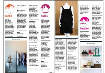
Shopping Guide pages 2 and 3