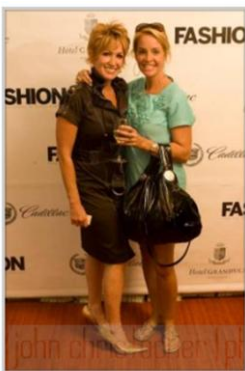
Party guests at step-and-repeat