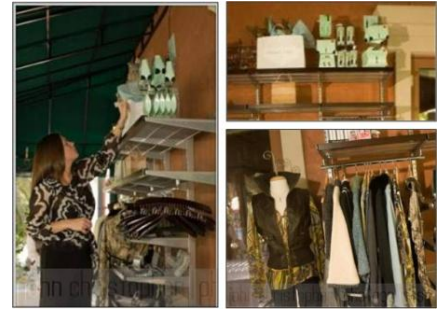
Houston partygoers check out the Cadillac Closet