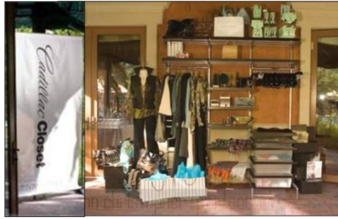
Cadillac Closet, Houston, featuring items from FASHION co-sponsors