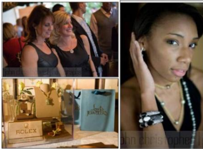
Models and party guests try on jewelry sponsors' designs