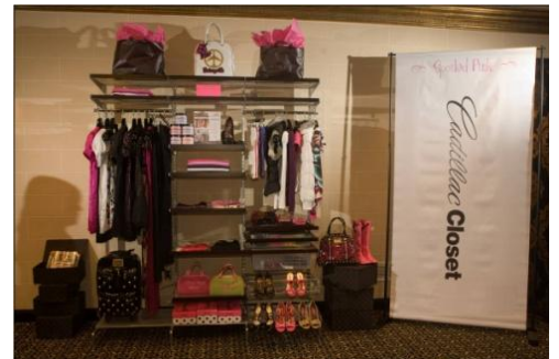
Cadillac Closet, Dallas, featured clothes and accessories from event co-sponsors