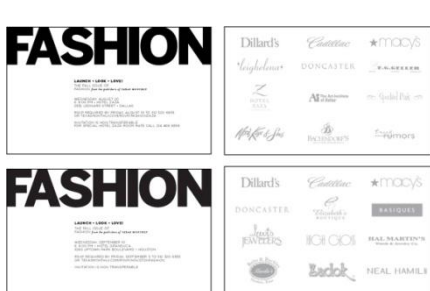
FASHION issue launch invitations, Dallas and Houston