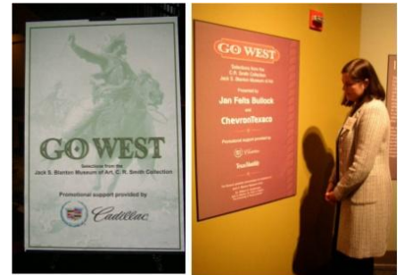
Museum exhibit signage featuring Cadillac's logo