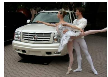
Performances were featured with Cadillacs as a backdrop