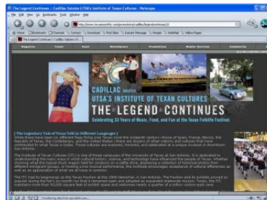
Cadillac and the Institute of Texan Cultures on texasmnthly.com