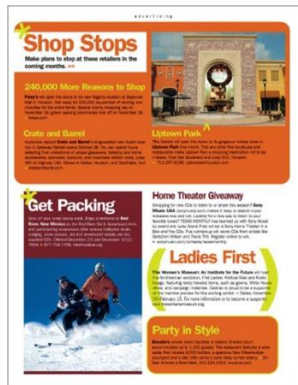
Cadillac's sponsorship of First Ladies exhibit featured in Texas Monthly promotion page