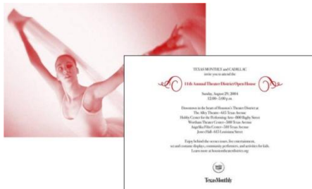
Houston Theater District Open House invitation featuring Cadillac's logo