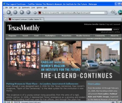
Cadillac and The Women's Museum on texasmonthly.com