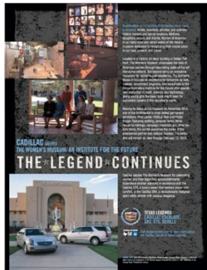
Partner: The Women's Museum, Dallas Texas Monthly Nov 04 issue