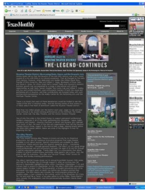
Cadillac and the Houston Theater District on texasmonthly.com