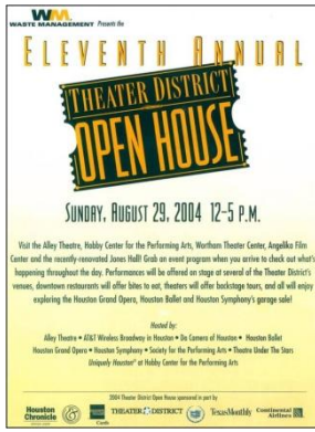
Houston Theater District program features Cadillac's logo