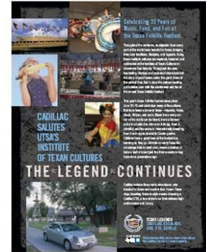
Partner: UTSA's Institute of Texan Cultures. SA Texas Monthly Jun 04 issue