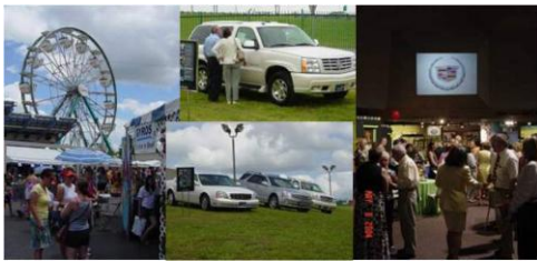
Vehicle display at the Institute of Texan Cultures; sponsorship of poster unveiling reception