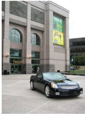
Cadillac display outside the Bob Bullock Museum