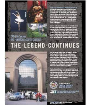
Partner: Houston Theater District Texas Monthly Jun 04 issue