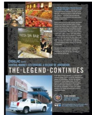
Partner: Central Market Texas Monthly Feb 05 issue