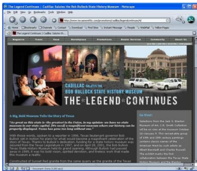
Cadillac and the Bob Bullock Museum on texasmonthly.com