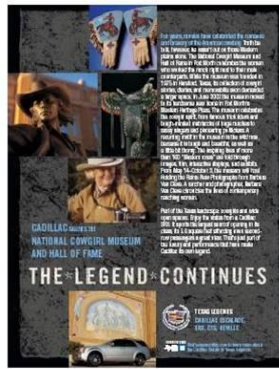
Partner: National Cowgirl Museum, Fort Worth Texas Monthly May 04 issue