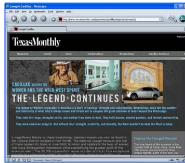
Cadillac and the Cowgirl Museum on texasmnthly.com