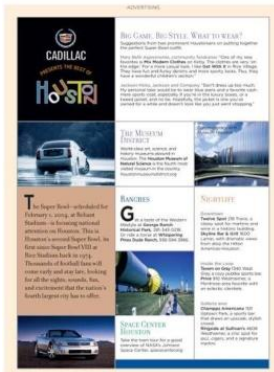
Cadillac presents the Best of Houston kicked off 2004 with highlights of the city's events