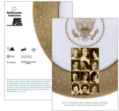
First Ladies exhibit gala opening invitation featuring Cadillac logo