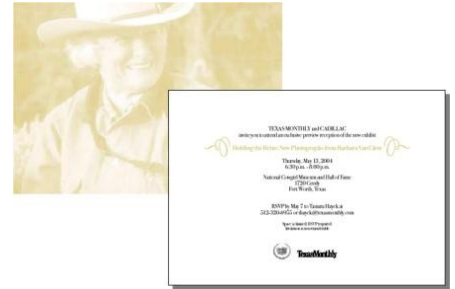
Cowgirl Museum exhibit VIP preview invitation featuring Cadillac's sponsor logo