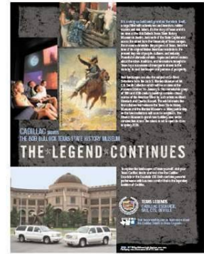
Bob Bullock Texas State History Museum, Austin Texas Monthly 10-04 issue