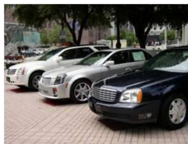
Multiple vehicles were displayed in the District