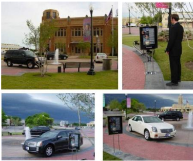
Vehicle display and signage at the Cowgirl Museum